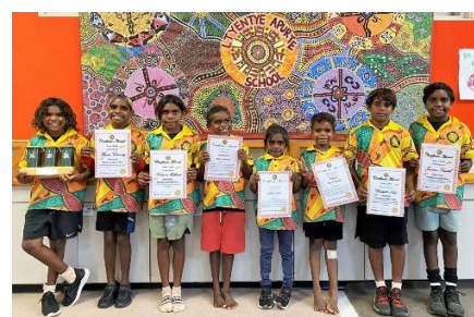
☀ STUDENT STARS OF THE WEEK ☀